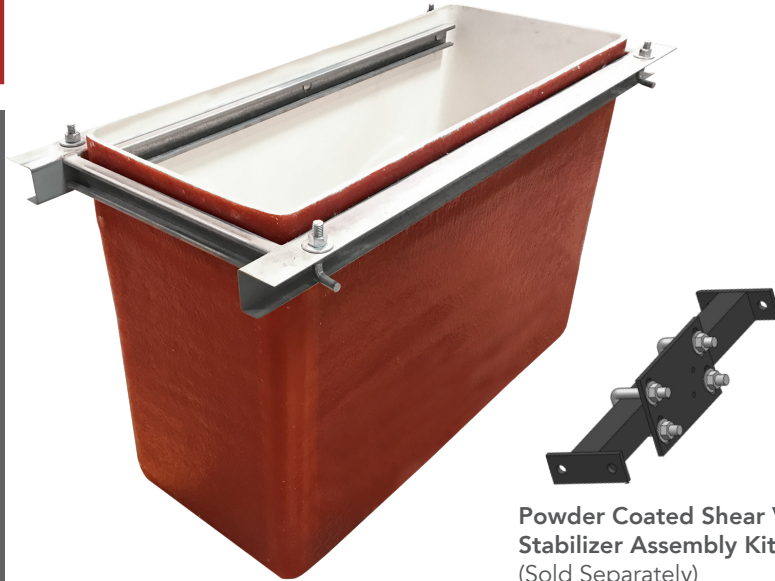
Powder Coated Shear Valve Stabilizer Assembly Kit (Sold Separately)