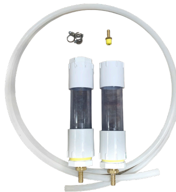
Interstitial Fluid Adapter Kit EQP-IF-ADP-UC